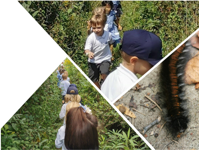
Fun in the Sun!

Year One had a wonderful week, exploring the natural environment around the school as part of their topic lessons. They drew plants, made collection baskets, practised reading and labelling things found, and went for a walk in the nearby woodland making flower bracelets as they walked.