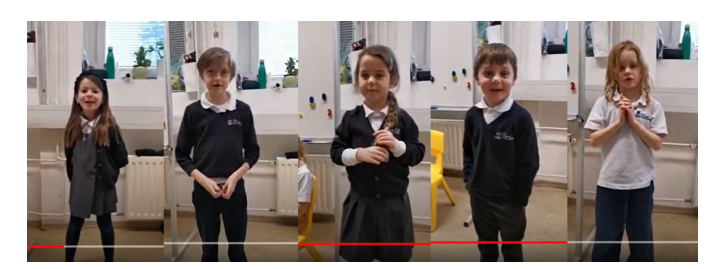
watch the video here

We have asked Year 1 what the word culture means to them. Students have provided many diverse answers. Have a look at our lovely photo and video.