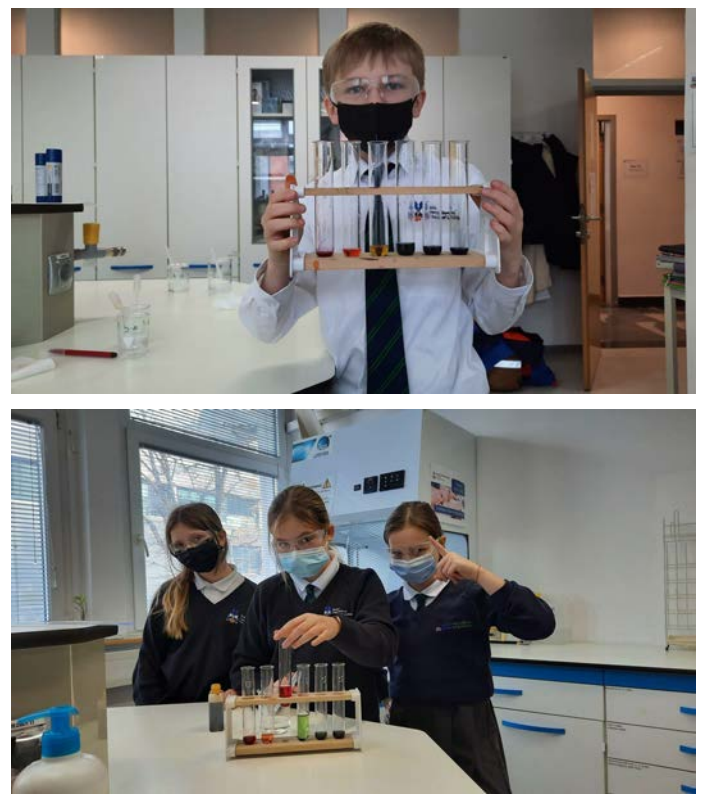
Year 8s were experimenting with different coloured light and colour filters, whereas students from science club learned about health and safety in

Year 7s were introduced to neutralisation reactions. They were successful in making a rainbow of different coloured solutions. They achieved that by mixing universal indicator with different volumes of acid and alkali. Universal indicator exhibited a smooth colour change in solutions of different pH values.