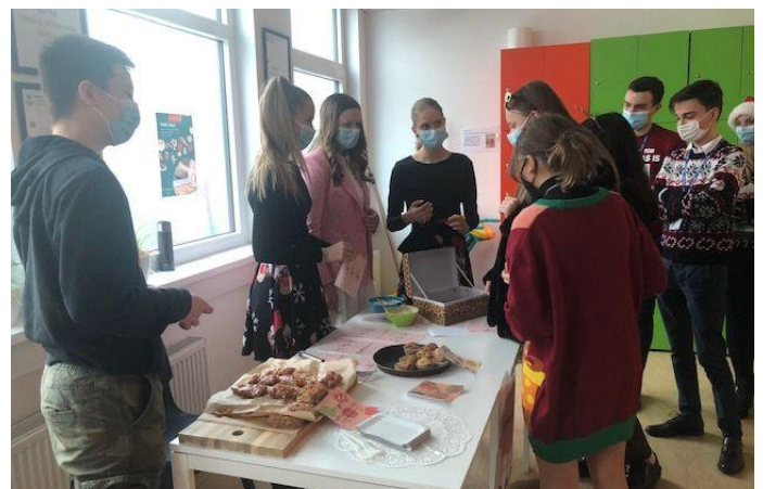
Friday's Bake Sale proved a popular and huge success.