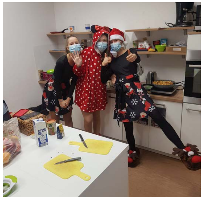
Baking up a storm for the Bake Sale