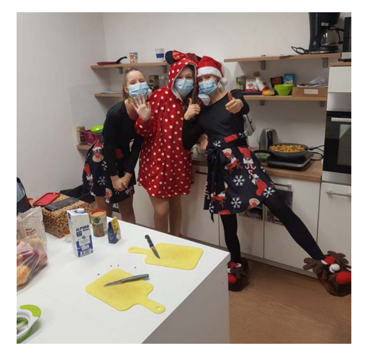
Baking up a storm for the Bake Sale