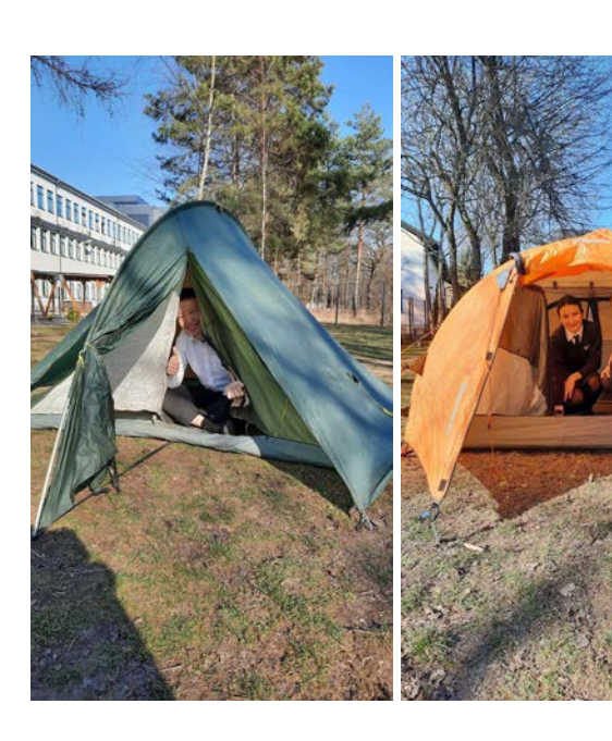
Zoja, MEPI participant