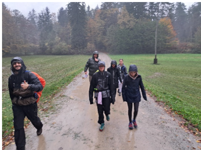
‘Smiles in the rain!’

There is a good expression in English that can be applied in these situations – ‘ There is no such thing as bad weather, it is just weather ’ – which means that everything in life should be viewed as an opportunity. Our MEPI students and staff are certainly examples of ensuring they meet both expected and unexpected challenges faced.