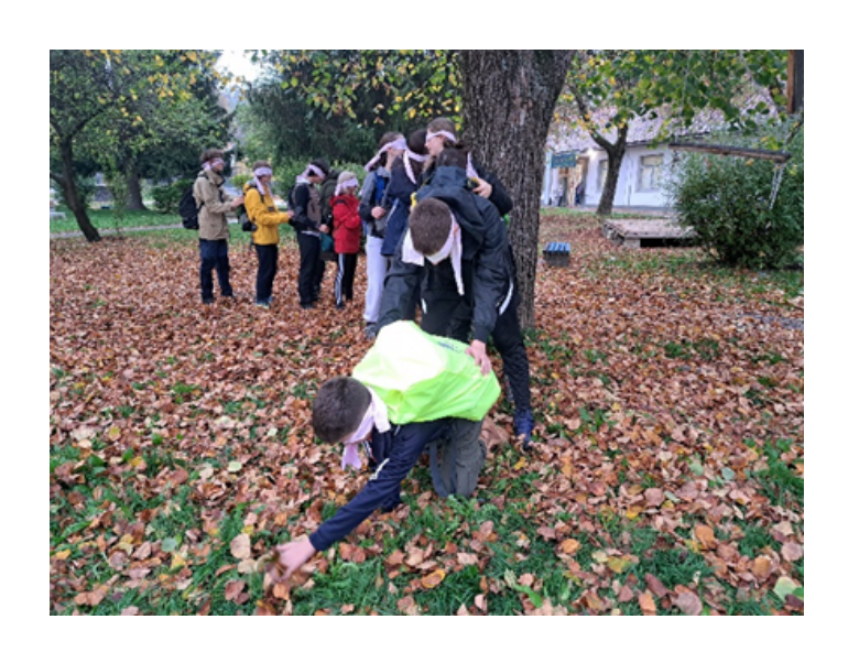
What could be more fun than 15 people, bound together and blindfolded, searching for an egg in a park full of autumn leaves?

The heavy rain that fell this morning as I arrived at school, reminded me very much of our 15 MEPI (International Award students from secondary) who, alongside 6 members of staff, conducted some team building and a practice hike two weeks ago in Škofja Loka- that event also took place in the pouring rain with great resilience being shown by all.