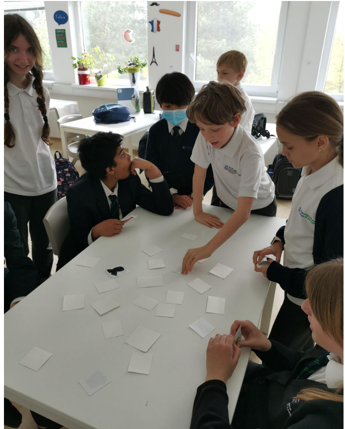
Well done Year 7.

This week Y7 Slovene Adv. students were learning about idioms. The students looked for differences in