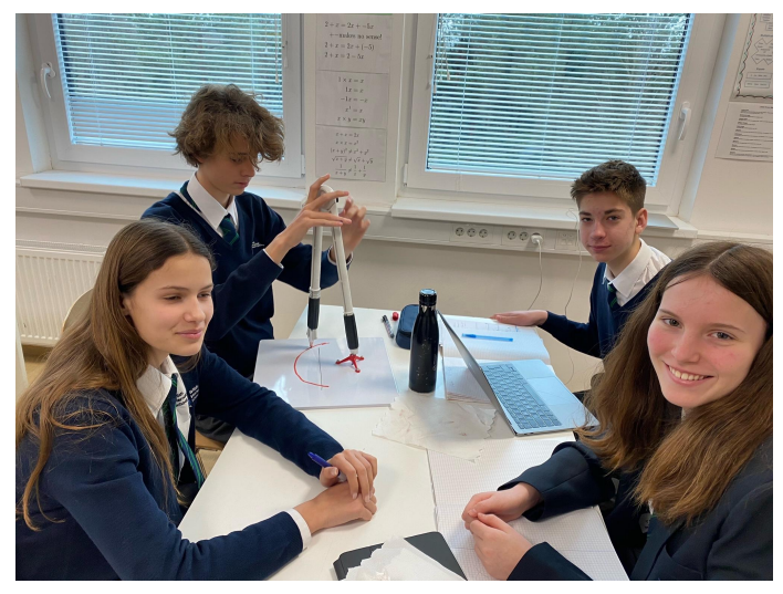
Year 10 students revised simultaneous equations and learnt how to systematically construct linear equations from harder geometrical and word problems.

Year 11 students practised plotting graphs and using them to solve equations. They also learnt that curves do not have the same gradient throughout and that differentiating the curve gives them its gradient function.