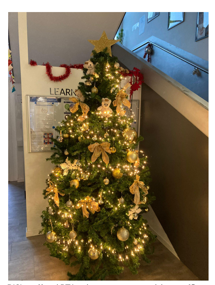
BISL staff and PTA volunteers are organising a raffle at the event and want to thank everyone that has donated goods for the occasion, we really couldn't have done it without you!!! If you would still like to

We are only one week from a fantastic family event at our school - the Christmas Fayre!