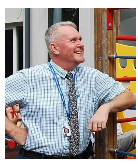
Principal's Update Friday 9th December 2022