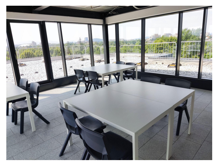
Year 7 & 8 Adventure Days Gallery