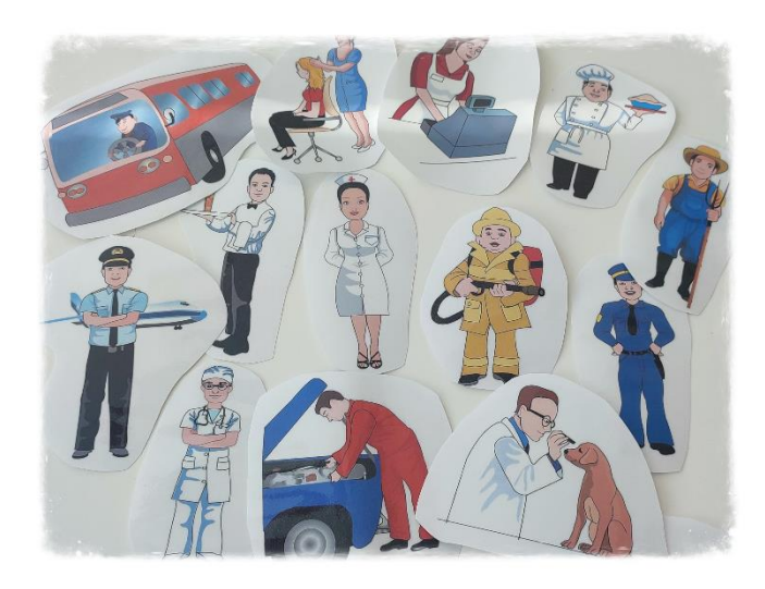
Great job, le tako naprej!

Year 3 and 4 at Slovene Foundation have been learning about professions this week. Students really enjoyed talking about it and discussing what they want to become when they grow up. They were also very creative while drawing the professions in their notebooks.